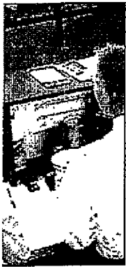
Bank robber shown with them when